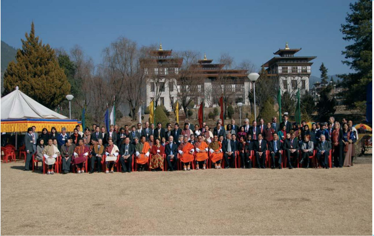
Participants at the Tenth Round Table Meeting, Thimphu 2008